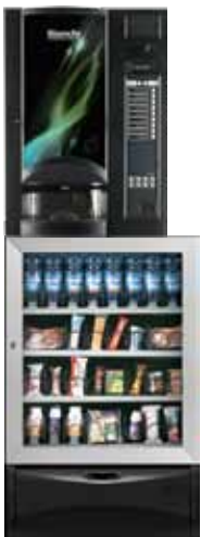
BVM 921 + VISTA S