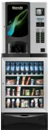
BVM 931 + VISTA S