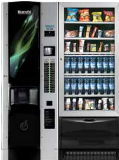
BVM 972 + VISTA L