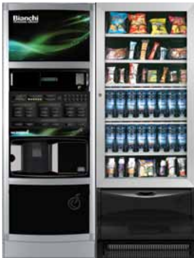
LEI 2CUPS + VISTA L