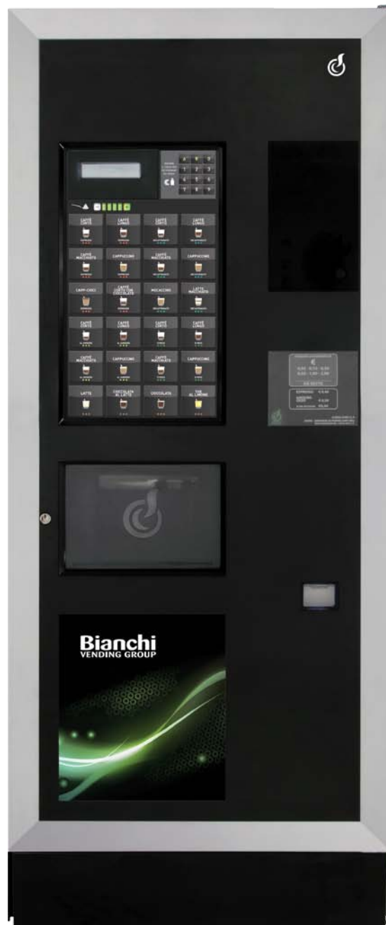
LEI500 M TACTILE SELECTION PANEL STT

LEI500 M, THE NEW DESIGN CONCEPT THAT OFFERS MODULARITY, FLEXIBILITY AND COMMUNICABILITY.