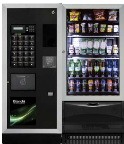
LEI 500 M DIRECT SELECTION PANEL + VISTA M